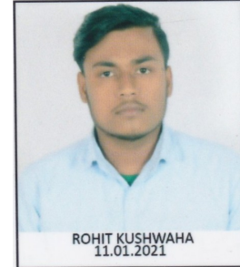
Director, Academic Affairs