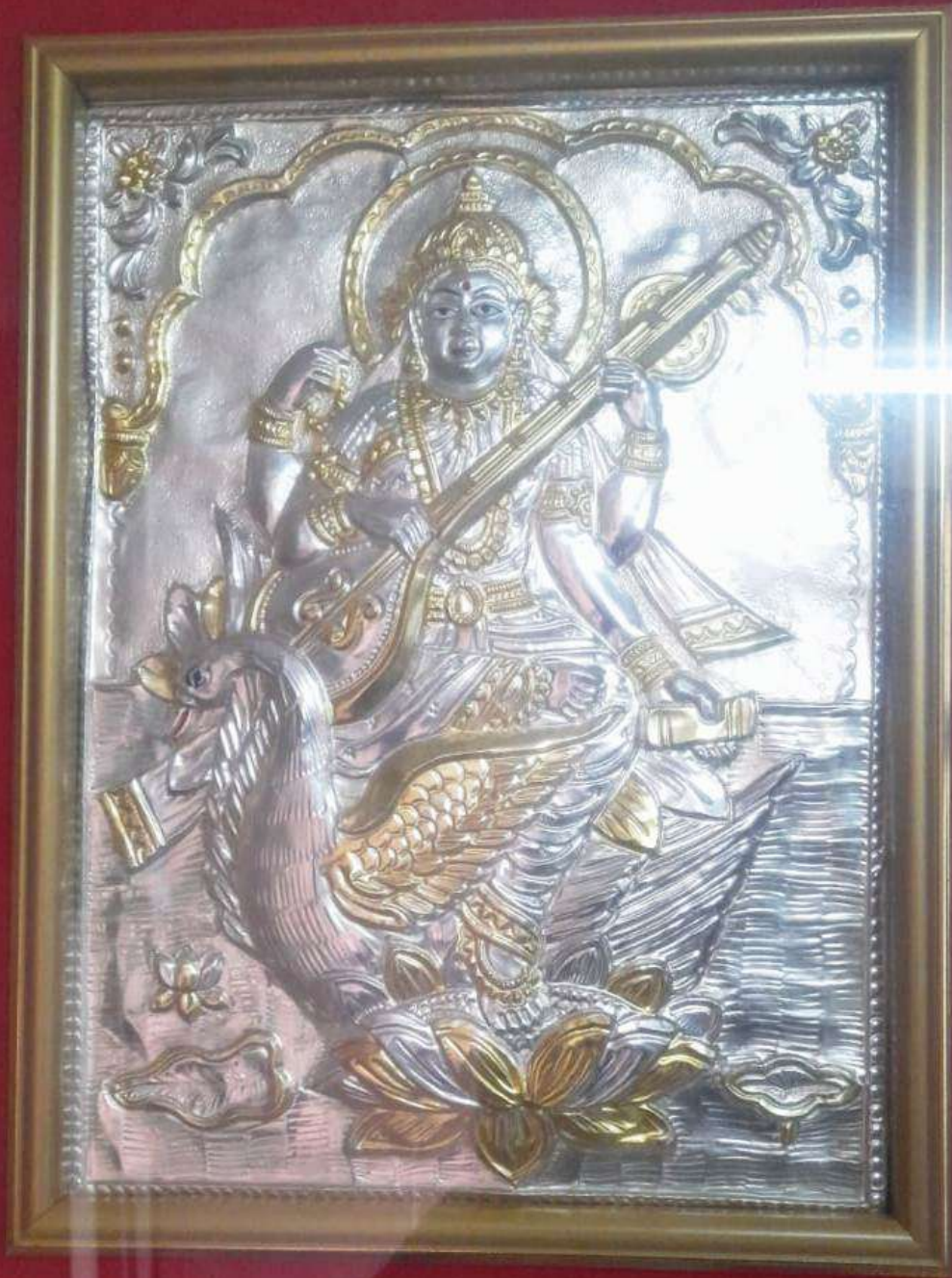
वाग् देवी अखिल भारतीय विद्वत् परिषद्