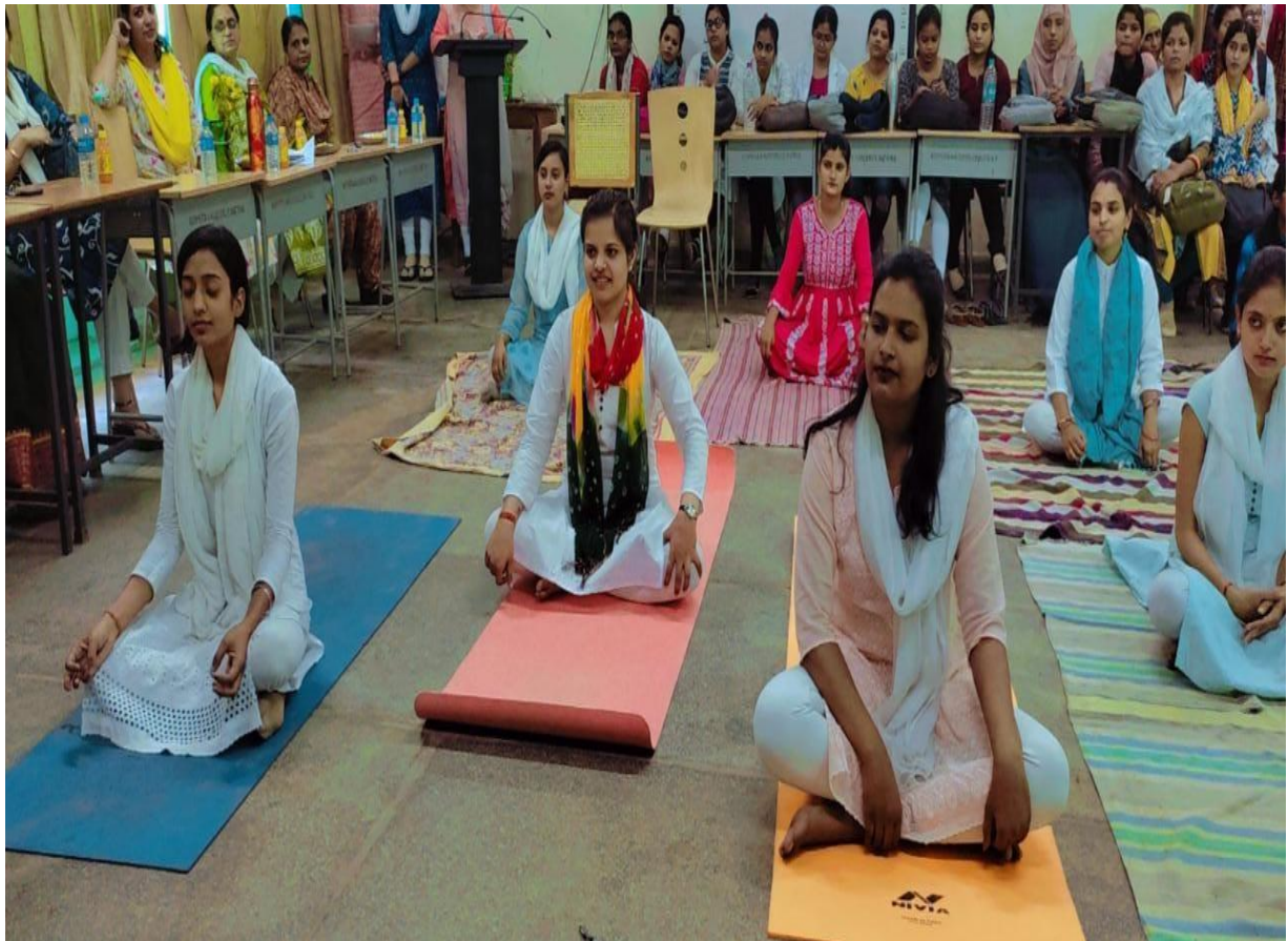
State Level Yoga